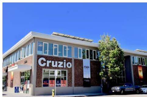
Cruzio’s headquarters in downtown Santa Cruz www.cruzio.com